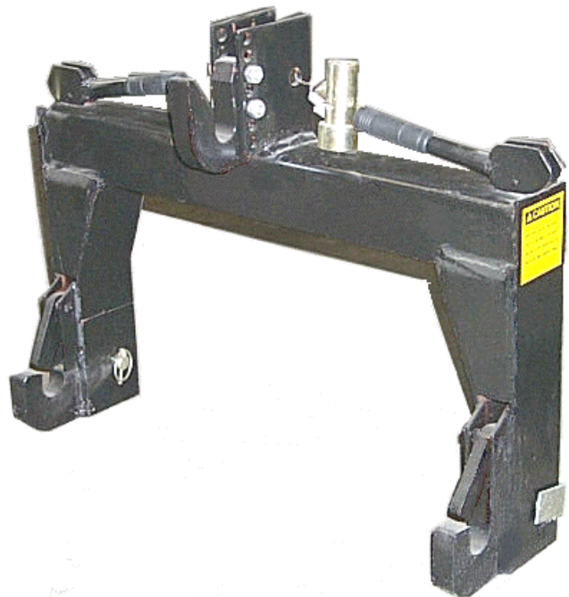
QH-101 Cat. 1 Quick Hitch

The QH-101 adjustable quick hitch is ruggedly built and rated for tractors up to 50 hp.